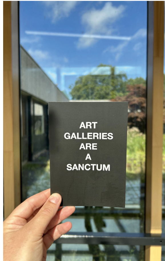
Figure 5 Photograph of the postcard with the slogan ‘Art Galleries are a Sanctum’ (Preston, 2023c)

The Bookstagram community is situated within a larger set of book promotion activities in the online space that cultivates ‘book buzz’ with an ‘ethos of bookishness’ (Murray and Striphas both cited in MacTavish, 2021, p. 82). Bookstagram has structures of hierarchy in terms of professional and non-professional users and differences in the numbers of followers that the accounts have amassed. MacTavish (2021, p. 85) points out, however, that the hashtag search system and the algorithms working with the functions of the platform that allow users to share posts by other users, sorting the feed in personalized ways for the user, effectively flatten this hierarchy. Thereby smaller – non-professional – producers have the potential to wield influence of equal power to that of traditional industry professionals such as the literary agent, brand name author, editor, and bookseller. The mix of ‘niche content creation’ and a supportive community of followers in this networked platform is keenly observed in the Instagram posts presented in this article, although these posts are not tagged with #bookstagram and so are not directly connected to this stream of content. At the time I posted about ‘The Power of the Small Press’, I had not recognized that the green band in my post echoed the branded colour of HCZF 2021 (see Figure 5). I tagged HCZF and the event speaker in