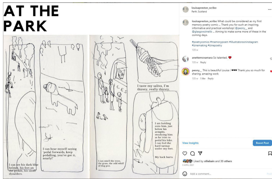
Figure 3 Instagram post of 'At the Park' memory poetry comic (Preston, 2021c)

that workshop was my first attempt at a memory poetry comic. This memory poetry comic was developed from the raw sketches and sentences I made of a memory that came to mind from the prompts given in the workshop. The five-panel comic, titled 'At the Park' (Figure 3), depicts my memory of being at the park when my son was learning to ride his bike.