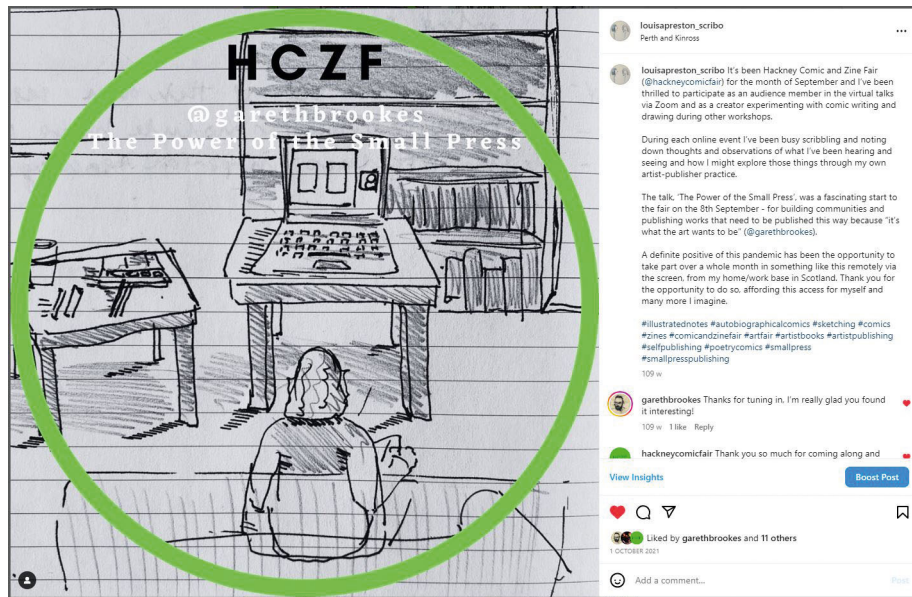
Figure 4 Screenshot of the Instagram post about ‘The Power of the Small Press’ event at HCZF (Preston, 2021a)

stills in the striking apple green colour which, in effect, advertises the fair as well as the talk. The caption on the post states, ‘It’s live. @hackneycomicfair is go!’ The hashtags #hczf #comics #zines and #diyartesanato are included and the @hackneycomicfair account is also tagged (Brookes, 2021). The hashtag #comics had 33.4 million posts on 9 November 2023. The cover images of the physical publications are presented squarely in each image space in the carousel. Each print publication is placed on a neutral-coloured linen fabric background which adds to the visual physical materiality of the image being presented through the digital mode of viewing on the Instagram platform. These images also contrast with the green background design familiar to viewers as belonging to or related to HCZF.